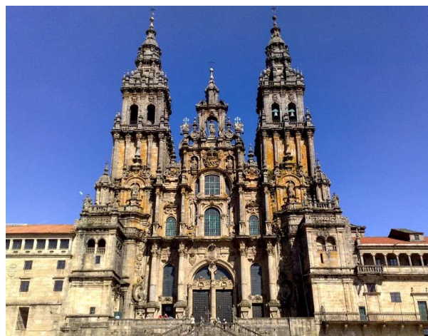
Santiago de Compostela Cathedral

I am very excited – looking forward to my holiday following the 'Way of St James' to Santiago de Compostela . I'm doing this in what is the easiest way for me; I will be 71 when I go and have no history of long treks with my belongings on my back! ( this was the route taken in the film "The Way" which was used as the ecumenical lent study course earlier this year )